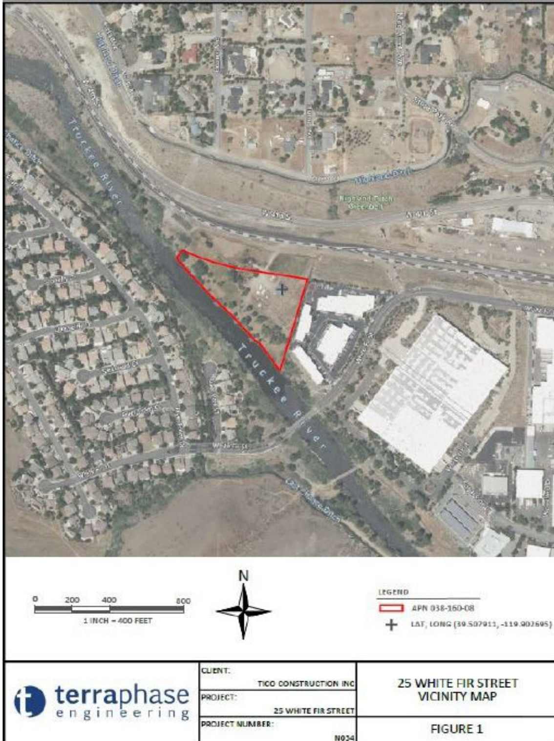
2) Proposed project location map